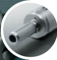
Sterilisable BASCH motor