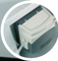
With or without integral peristaltic pump